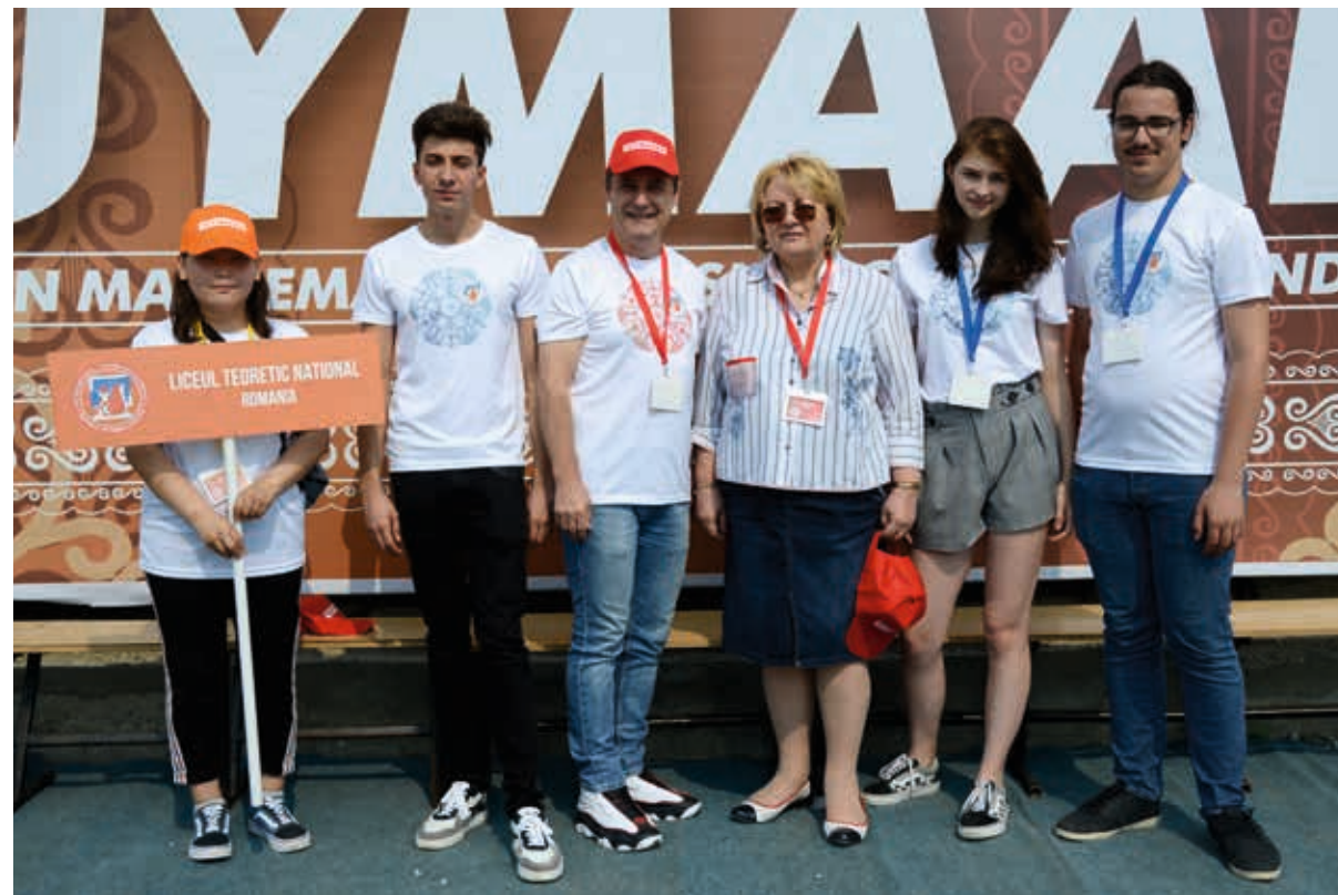
LICEUL TEORETIC NATIONAL, ROMANIA