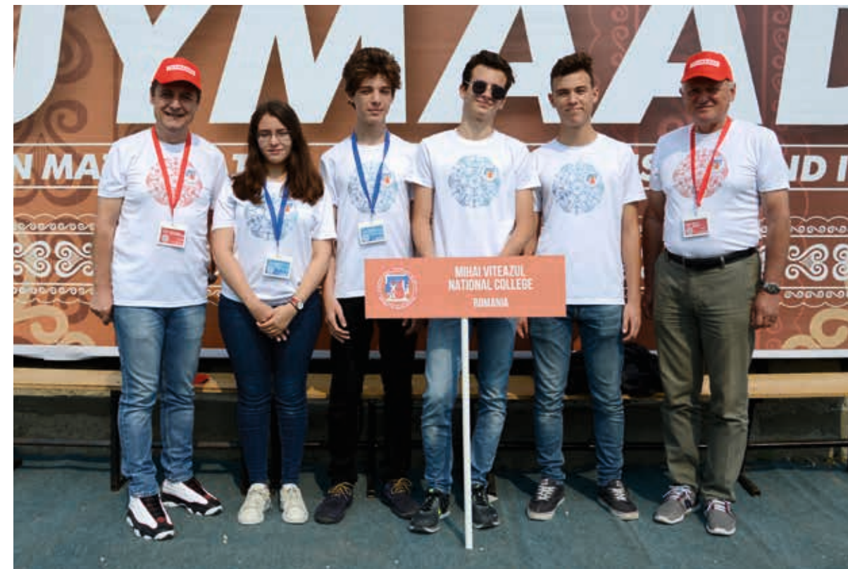
MIHAI VITEAZUL NATIONAL COLLEGE, ROMANIA