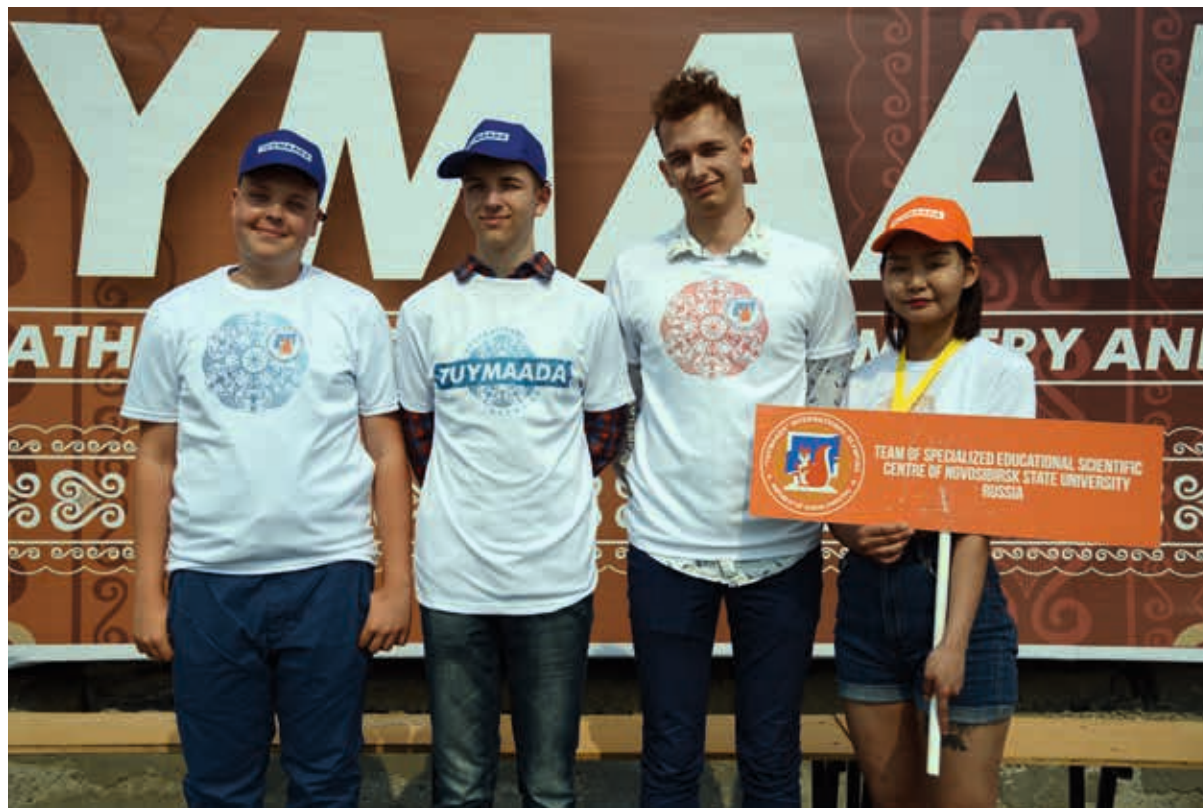
SPECIALIZED EDUCATIONAL SCIENTIFIC CENTRE OF NOVOSIBIRSK STATE UNIVERSITY, NOVOSIBIRSK OBLAST, RUSSIA